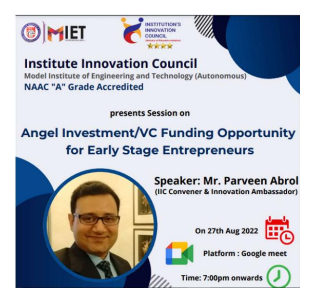
Fig 1: Poster of the event