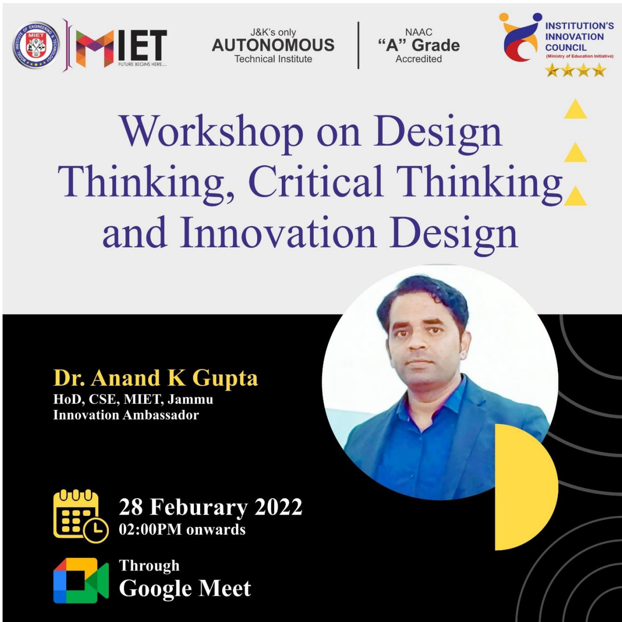
Fig 1: Poster of the event