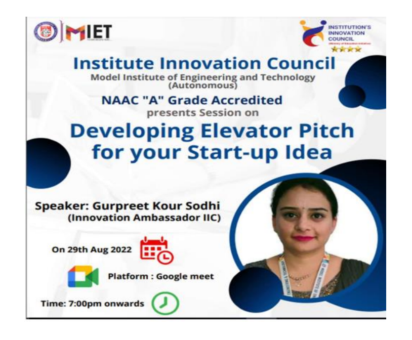
Fig 1: Poster of the event