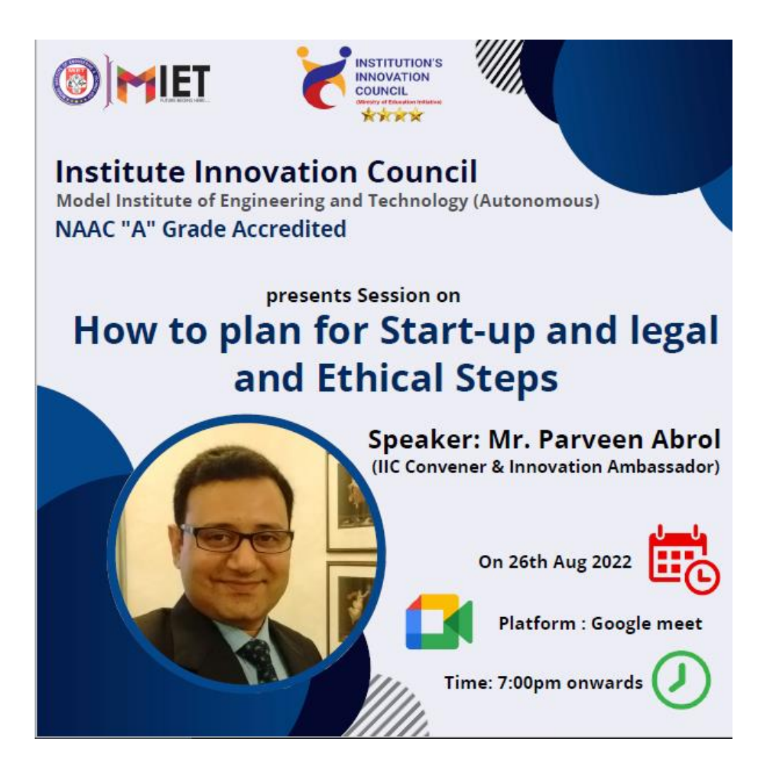
Fig 1: Poster of the event