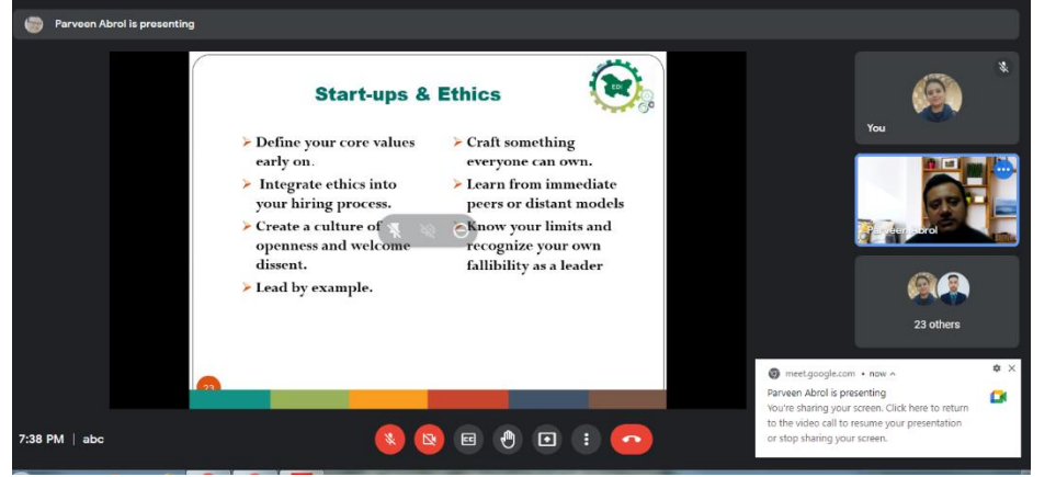
Fig 2: Everyone participated enthusiastically and enjoyed the session

(Permanently Affiliated to the University of Jammu, Accredited by NAAC with "A" Grade)