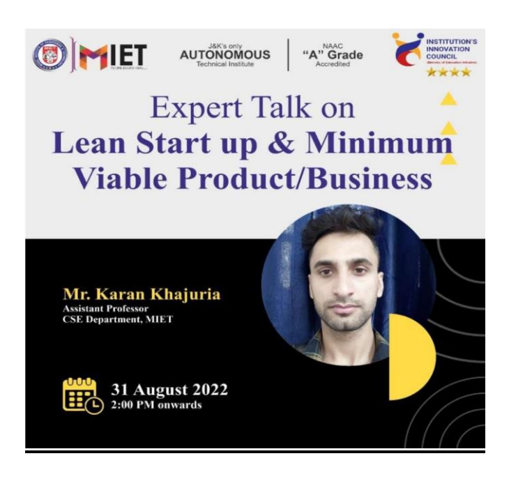
Fig 1: Poster of the event