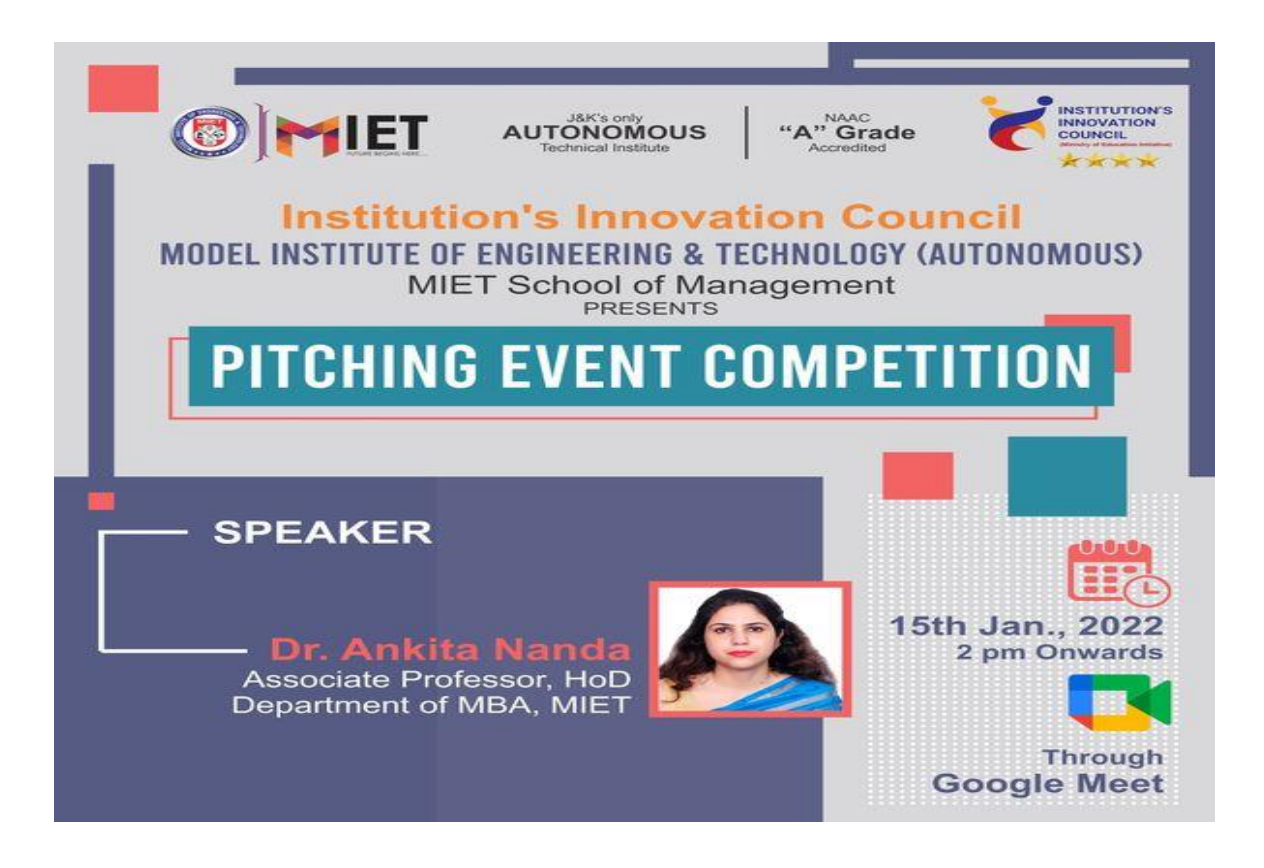
Fig 1: Poster of the event