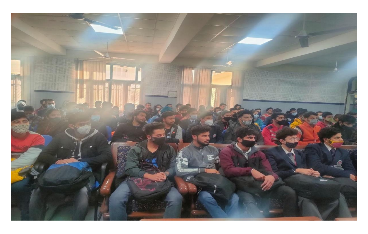
Fig 2: Everyone participated enthusiastically and enjoyed the session