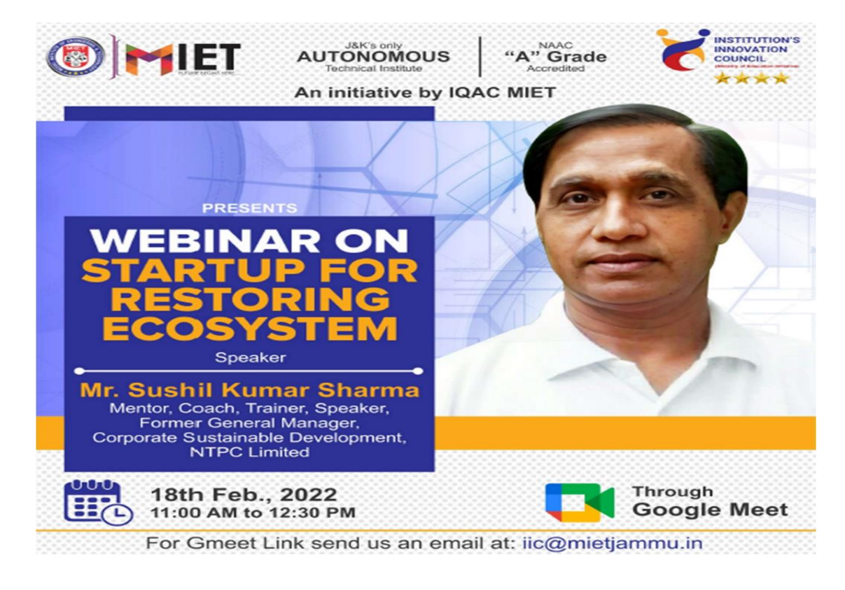
Fig 1: Poster of the event